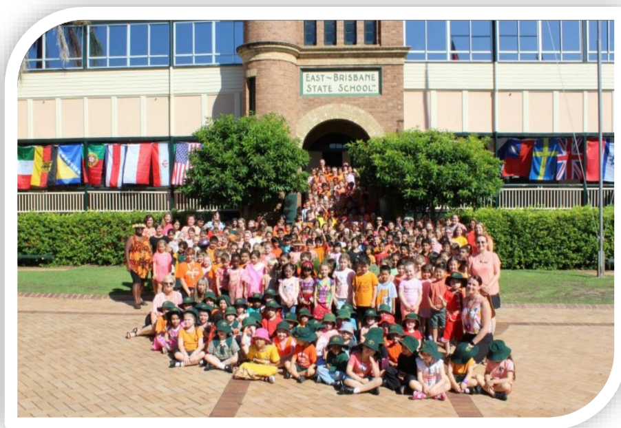
The whole school - Harmony Day